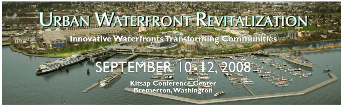
Exhibit Opportunities & Info

Give your company visual presence at the conference and be seen by decision makers that matter. Be the center of attraction during buffets, coffee, networking breaks, cocktail reception and exhibit times.